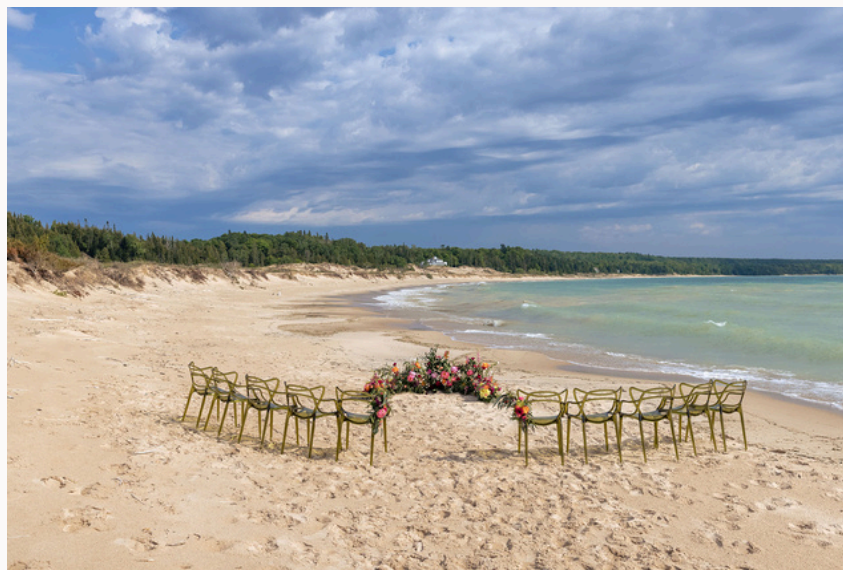
Rayan Anastor Photography