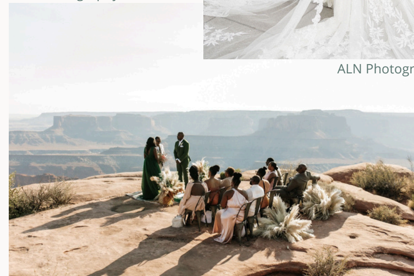
Elizabeth Wells Photography

For weddings beyond Michigan - 2 nights of lodging + flight or gas reimbursement