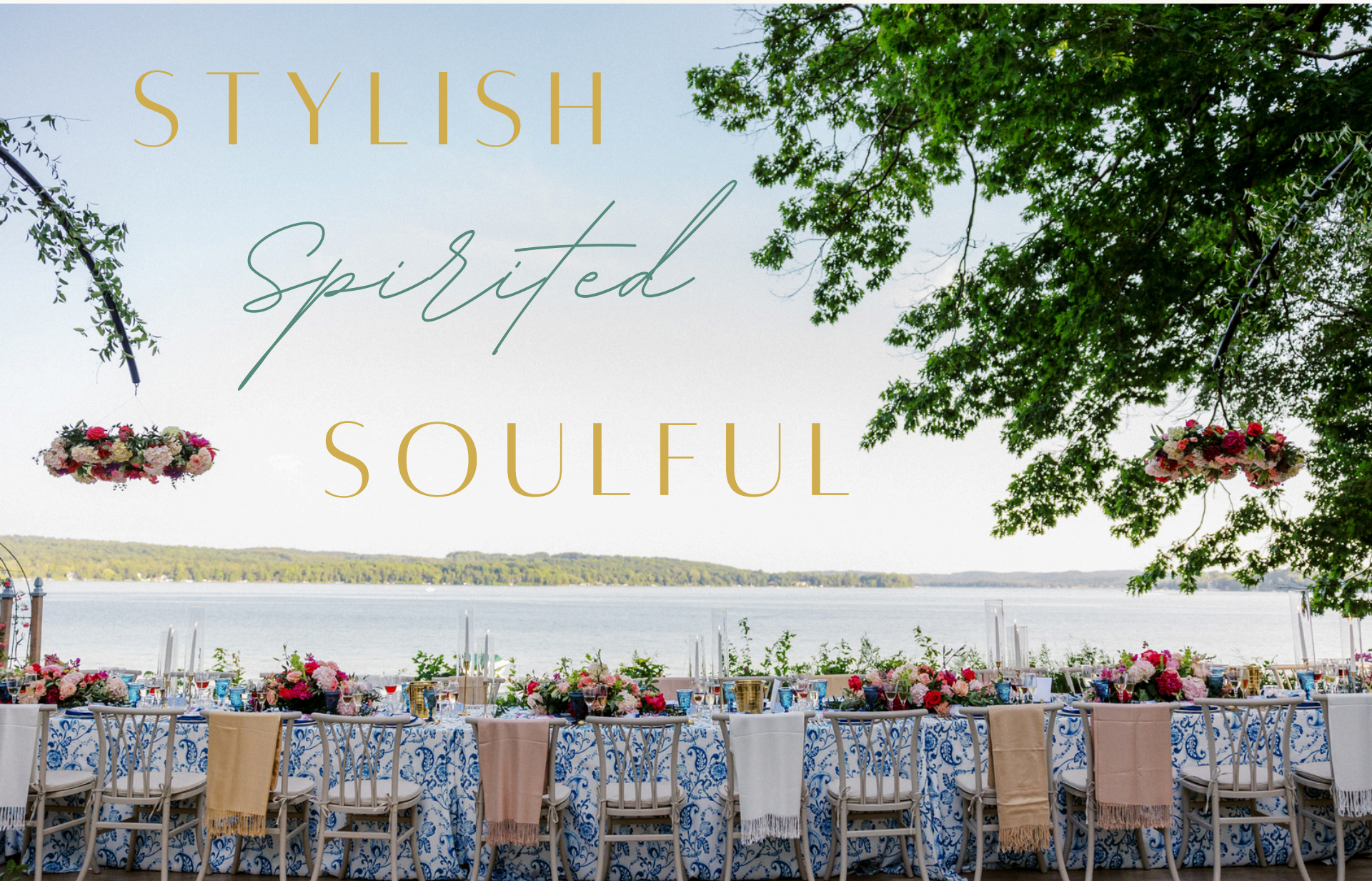
Lindsey Billings Photography