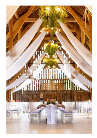
Rayan Anastor Photography