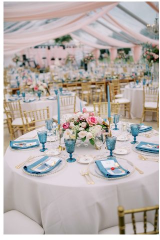
Carrie House Photography